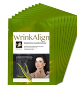
WrinkleAlign Forehead Patch-10 Pack $12.00