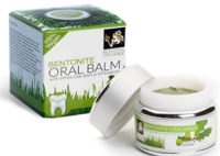
Bentonite Oral Balm 2 oz. jar (56g) $26.00