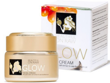
Facial Cream GLOW with Seabuckthorn Oil 2 oz. jar (56g) $26.00