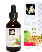
Scalp Tonic 2 fl. oz. bottle (60ml) $26.00