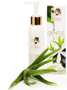
Gentle Facial Cleanser 4 fl. oz. bottle (118ml) $17.00