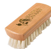
Body Brush $12.00