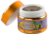
Green Clay Masque 2 oz. jar (56g) $26.00