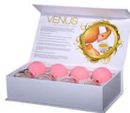
Venus Body Sculpting Cups $50.00