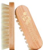
Facial Brush for Glowing Complexion $8.00