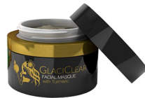
GlaciClear Facial Masque with Turmeric $26.00