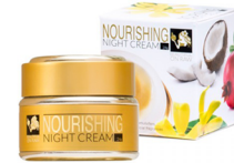
Nourishing Night Cream (22g) $26.00